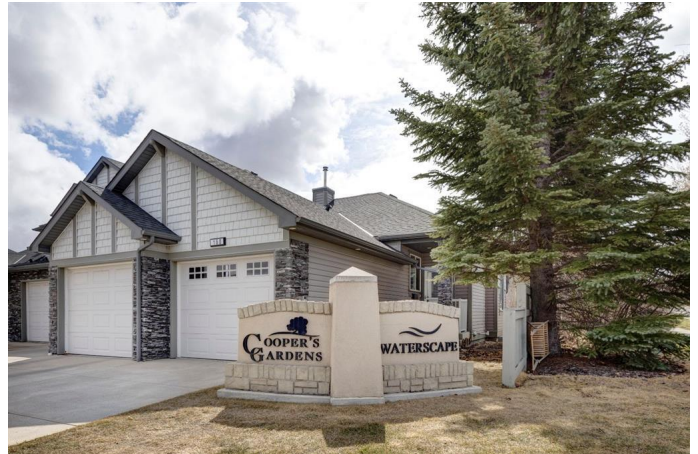
160-100 Coopers Common SW, Airdrie, AB

Step into the vibrant heart of Coopers Crossing and claim this rare end-unit bungalow villa, where modern elegance meets unbeatable location. Backing onto the community's scenic pathway system, this home boasts a sun-drenched south-facing deck and yard—perfect for savouring morning coffee or evening sunsets. Inside, meticulous care and recent upgrades elevate every moment. Refaced cabinet doors and drawers gleam in the kitchen, where a sleek moveable island invites culinary creativity. Hardwood flooring has been extended to flow seamlessly from the main living areas into the kitchen and two bedrooms, creating a cohesive, polished look. The main floor is a masterclass in functionality, with the kitchen leading to a spacious dining room, while the living room beckons with a cozy gas fireplace and patio doors that frame the deck's inviting views. A practical mudroom/laundry area connects to the double attached garage, ensuring convenience. Retreat to the primary bedroom, complete with a walk-in closet and a 3-piece ensuite, or host guests in the second bedroom with easy access to another full bathroom. Downstairs, possibilities abound. A spacious recreation room, bathed in natural light from two large windows, sets the stage for movie nights or game days. A third bedroom and full bathroom offer flexibility for guests or family, while an unfinished hobby space or workout room awaits your personal touch. Enjoy year-round comfort with a furnace and water