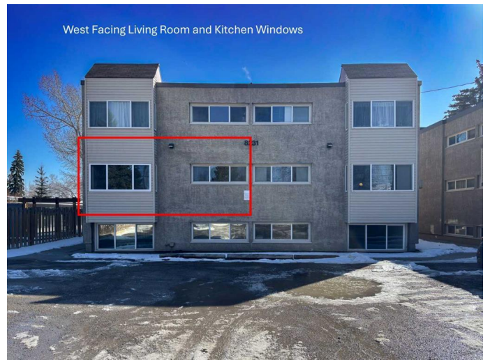
West Facing Living Room and Kitchen Windows

Data is supplied by Pillar 9â,,ç MLSÂ© System. Pillar 9â,,ç is the owner of the copyright in its MLSÂ© System. Data is deemed reliable but is not guaranteed accurate by Pillar 9â,,ç. The trademarks MLSÂ©, Multiple Listing ServiceÂ© and the associated logos are owned by The Canadian Real Estate Association (CREA) and identify the quality of services provided by real estate professionals who are members of CREA. Used under license.