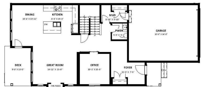
MAIN 1,085 SQ.FT. GARAGE 477 SQ. FT.