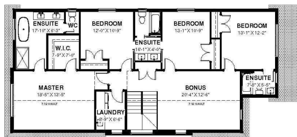
SECOND 1,546 SQ.FT.