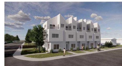
2201 46th STREET S.E.