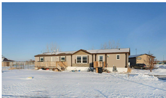
127 Meadowplace Dr E, Brooks, AB

Main Floor Exterior Area 1517.55 sq ft Interior Area 1391.31 sq ft