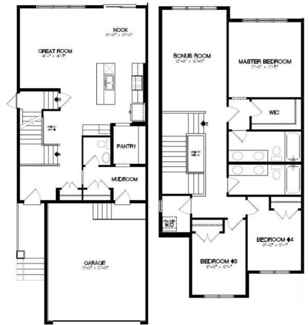
MAIN FLOOR - 864 SQFT

Data is supplied by Pillar 9â„¢ MLSÂ® System. Pillar 9â„¢ is the owner of the copyright in its MLSÂ® System. Data is deemed reliable but is not guaranteed accurate by Pillar 9â„¢. The trademarks MLSÂ®, Multiple Listing ServiceÂ® and the associated logos are owned by The Canadian Real Estate Association (CREA) and identify the quality of services provided by real estate professionals who are members of CREA. Used under license.