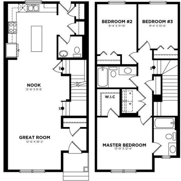
MAIN FLOOR - 773 SQFT